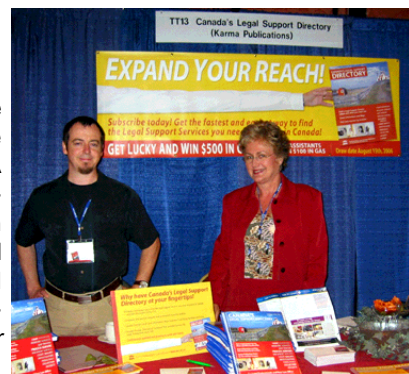
CBA Conference St. John's, NL

Newfoundland is a place easier to get to than leave we found. The CBA Conference was most successful and very lively! In St. John's we met and mixed with over 800 legal professionals and introduced them to CLSD, your directory.