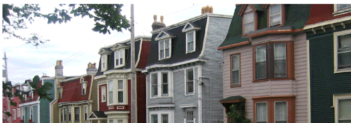
Queen's Rd. in St. John's NL, the oldest city in N. America