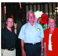
The Dockside Restaurant in front of bars from old jail!