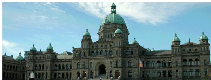
Legislative Assembly Building, Victoria, BC

We have a special offer for you. Many of you have been asked for our information and now for the first time, if you sell a directory or a subscription for CLSD, we offer you 50 percent of the retail price. Contact us for more on this. Toll Free: 1-888-891-4141