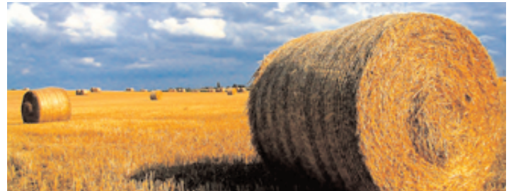
Alberta Prairie Landscape