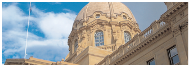
Alberta Legislative Building in Edmonton