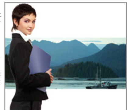
Grand Prize - Fishing Resort

Lawyers will be asked to place their business cards in our draw - more connections for you! This draw will take place on August 14 and winners will be announced in December's Red Tape .